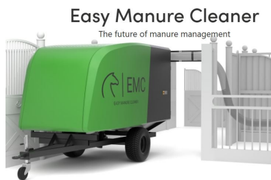
Easy Manure Cleaner The future of manure management

Please do also register if you can't join on this date but would like to attend in the future. Thank you very much!